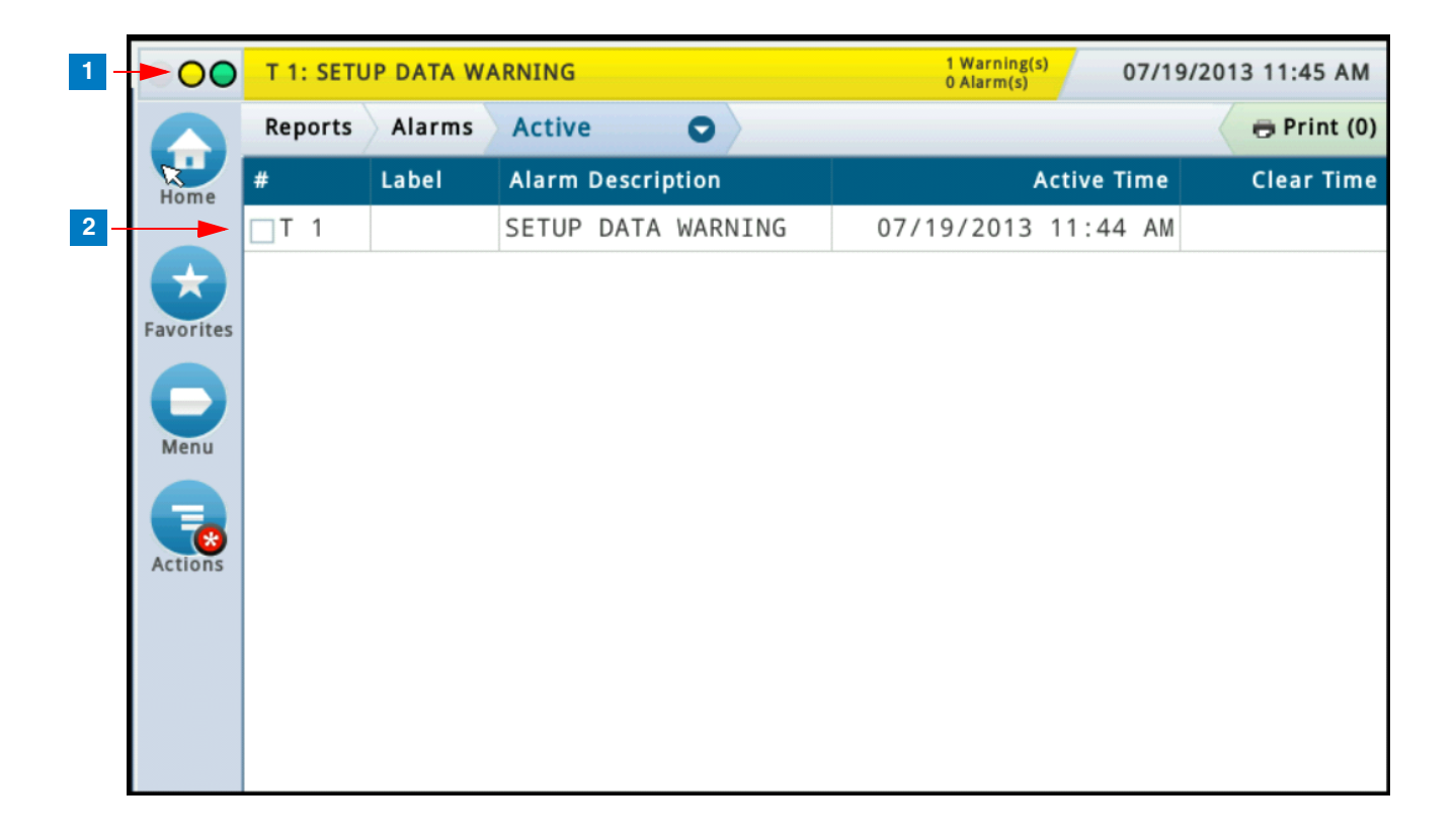
Figure 1. Alarm Report Screen

Once in the Alarm Report screen, touching the Status Bar again will acknowledge all selected unacknowledged alarms or the first active alarm if none are selected and turn off the console beeper (if it is turned on).