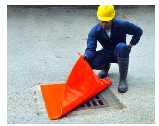
Ultra-Drain Seal helps seal off drains to minimize problems!

* Will cause the Ultra-Drain Seal™ to swell temporarily but not degrade.