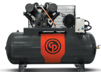
Two Stage Reciprocating Warranty - 2 Years