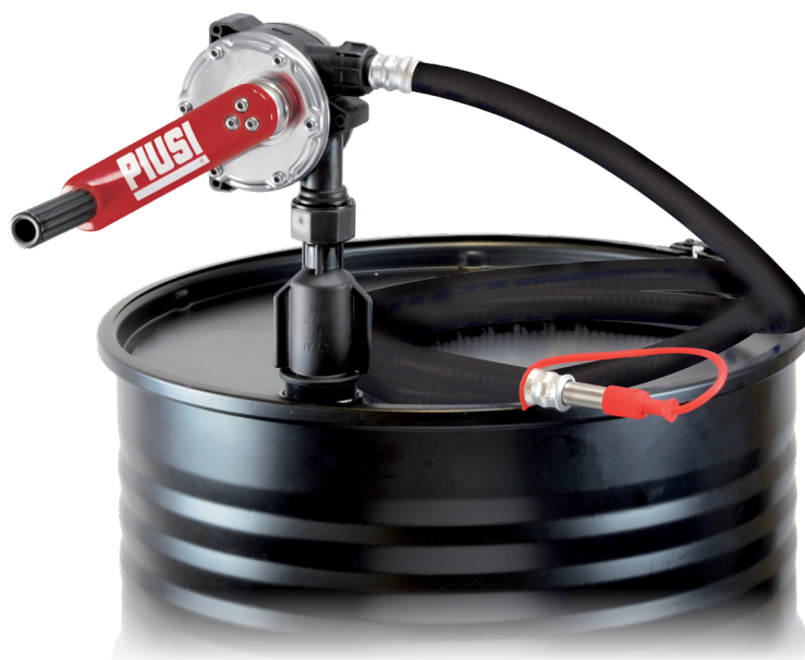
PIUSI HAND PUMP WITH HOSE AND STAINLESS STEEL SPOUT