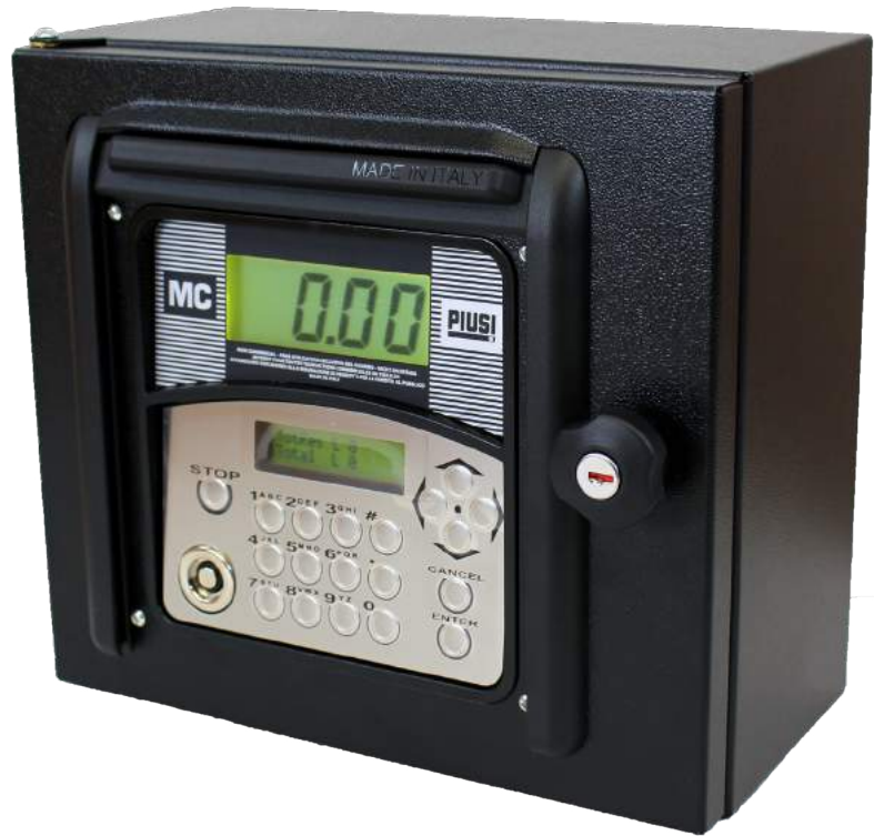
MC BOX 1.5