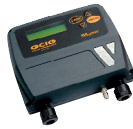
TANK LEVEL INDICATOR