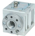
PULSE METER INPUT