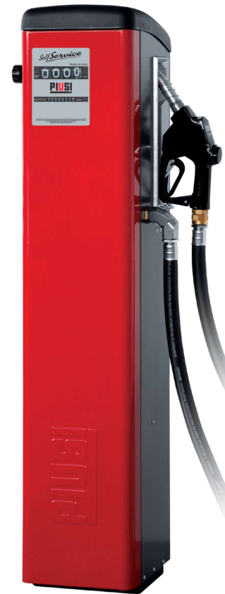
SELF SERVICE K44