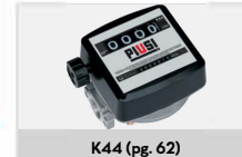
K44 (pg. 62)