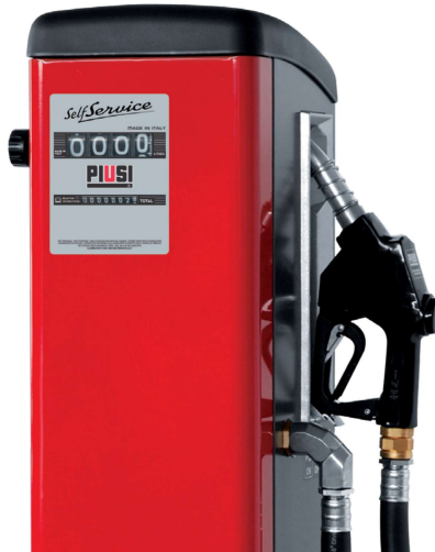
INTEGRATED MECHANICAL METER