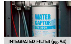
INTEGRATED FILTER (pg. 94)