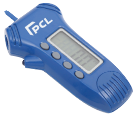
DIGITAL TIRE PRESSURE & TREAD DEPTH GAUGE