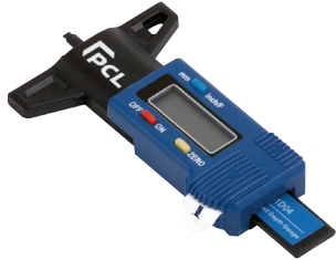
DIGITAL TREAD DEPTH GAUGE