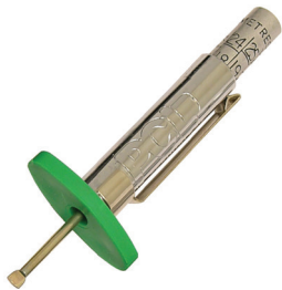
TREAD DEPTH GAUGE

DTPG7 DIGITAL TIRE PRESSURE & TREAD DEPTH GAUGE