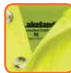
Tag free collars for greater comfort