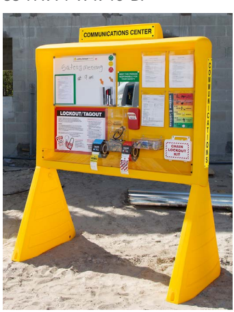
PBR101YL RAMS Board Communication Centers, yellow

Risk Assessment Management System displays important documents and safety information in one centralized location. Molded plastic free-standing board stand, 88"H x 74"W x 40"D.