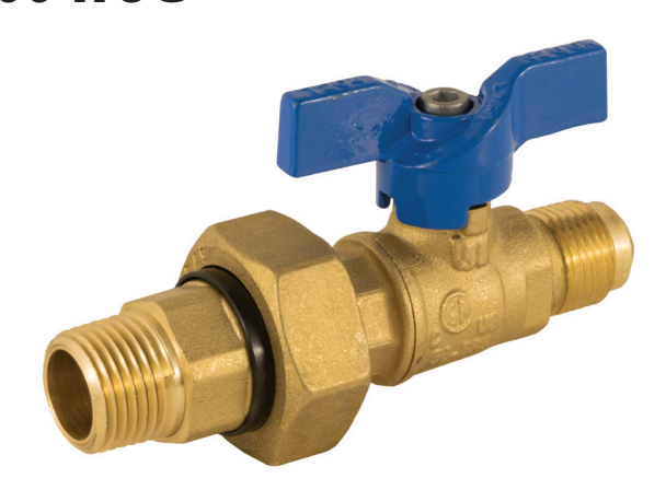
T-204DU MIP x FL