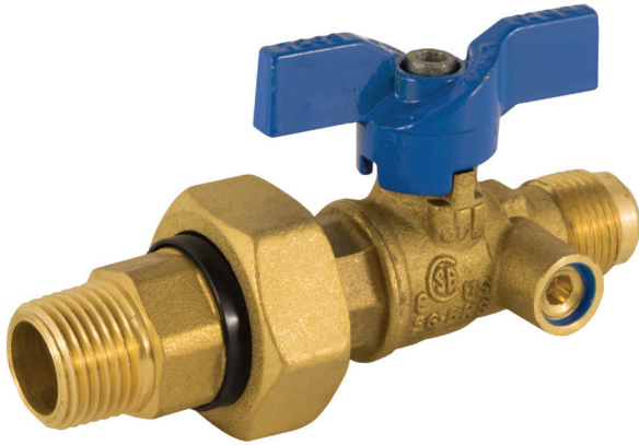
T-203DU MIP x FL