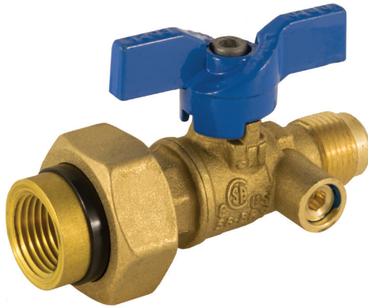
T-203DU FIP x FL