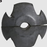
1232A - 1/2"