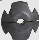
1232A - 1/2"