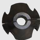
1234A - 1/4"