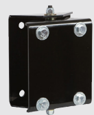
1282A - Swivel Bracket