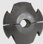
1233A - 3/8"