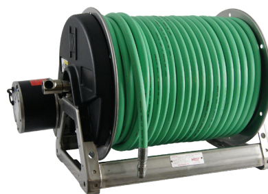
Middle: Model SNC-18E electric rewind reel (hose not included).