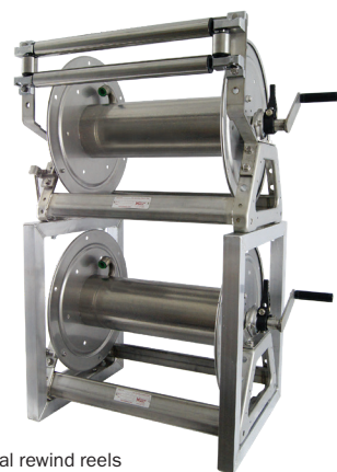
Bottom: Models SNC-18 manual rewind reels shown with optional stacking frame and rollers.