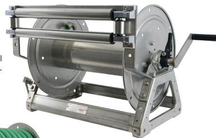
Top: Model SNC-18 manual rewind reel with optional rollers.