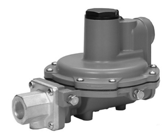
Figure 1. Type R632A Integral Two-Stage Regulator