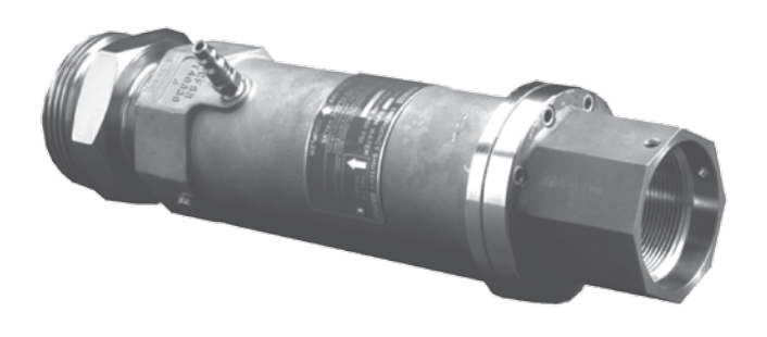
Figure 1. Type N563 Emergency Shutoff Valve