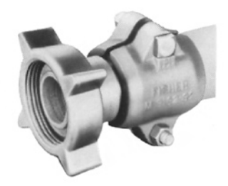
Figure 1. Types M3162 and M3162 Swivel Nuts