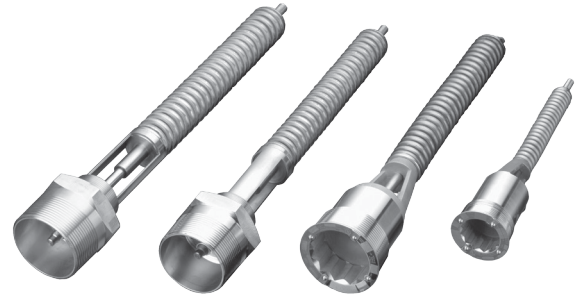
Figure 1. H5114, H284, H733 and H722 Series

adjusting screw and all other parts are inside the tank, safe from tampering.