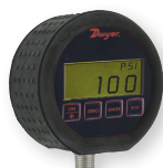
DPG-100 with protective rubber boot