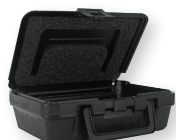
Protective carrying case