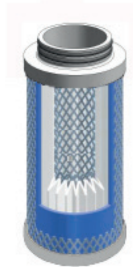
Cross section of the depth filter

The UltraPleat® MF filter element is designed and developed for the following applications: