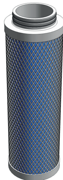
Depth Filter UltraPleat® FF