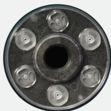
Bottom View of Check Valves