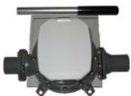
Top view of closed Trim Ring and Removable Handle