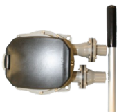
Top view of closed Trim Ring and Removable Handle