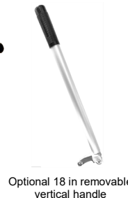
Optional 18 in removable vertical handle