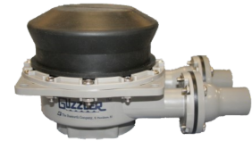
Shown with optional rubber boot/dust cover