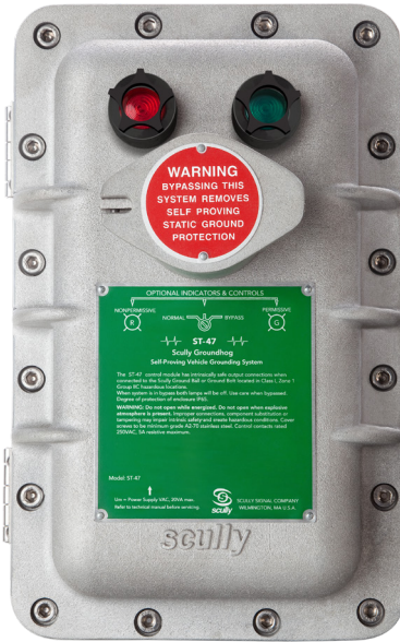
Groundhog Ground Verification System