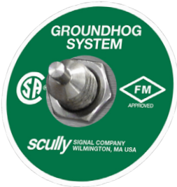
Scully Ground Bolt