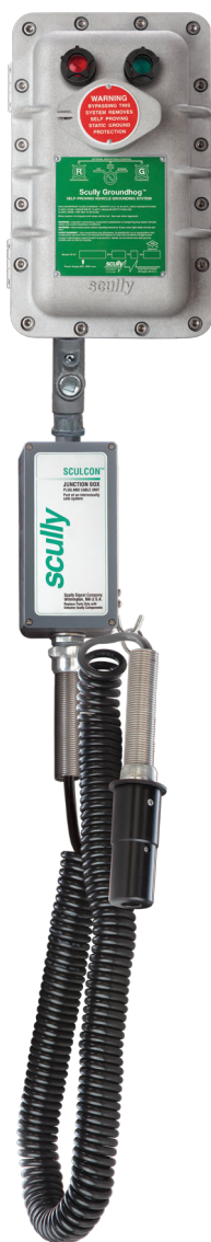
Scully Groundhog Control Monitor with Plug and Cable