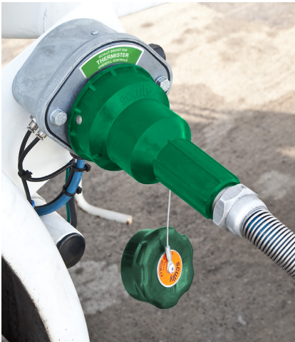
One Connection for Overfill Prevention and Grounding

The Groundhog utilizes a separate conductor in the existing Scully Overfill