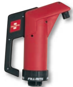
Model FR20 Piston Drum Pump Series 20