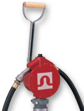
Model FR152 Piston Hand Pump Series 5200