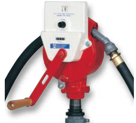
Model FR112C Rotary Hand Pump with Counter Series 100