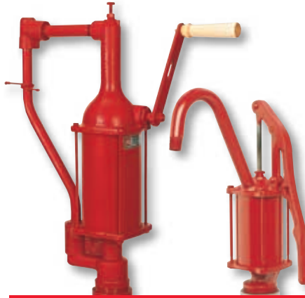
Model FR31 & FR43 Quart or Pint Stroke Pump Series 30