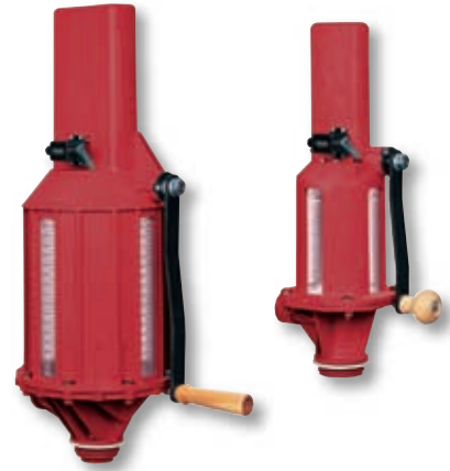
Model FR37 & FR38 Gallon or Quart Volumetric Hand Pump Series 30