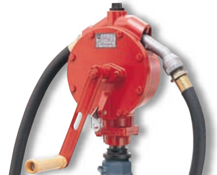
Model FR112 Rotary Hand Pump Series 100